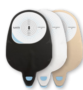
STANDARD FLAT BAGS