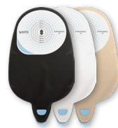
LARGE FLAT BAGS