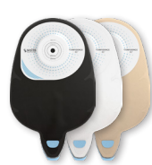
STANDARD CONVEX BAGS