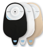
LARGE CONVEX BAGS